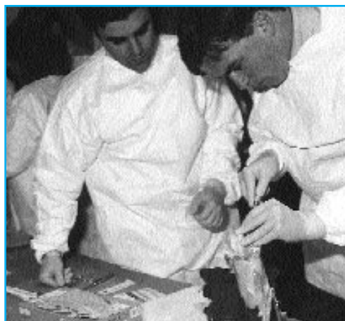
Mini Hands-On Labs provided interactive learning opportunities for attendees.