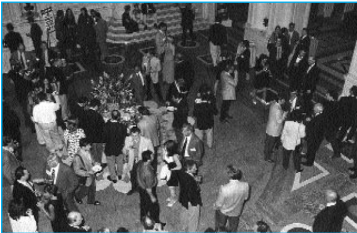
Attendees enjoy hors d'oeuvres and cocktails at the Welcome Reception at the Library of Congress.

(View and download more than 200 photographs from the 1999