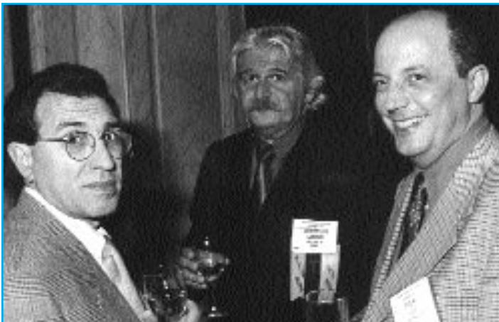
Three gentlemen talk over cocktails at the Farewell Banquet.