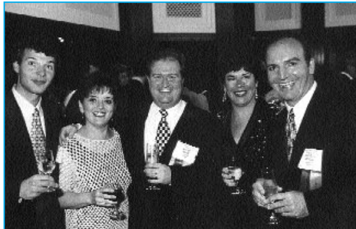
A group of attendees enjoys cocktails at the Farewell Banquet.