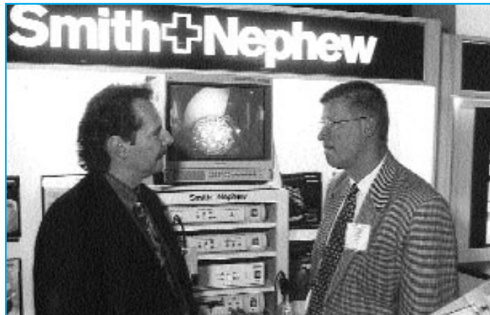
The more than 50 technical exhibits were extremely busy throughout the meeting.