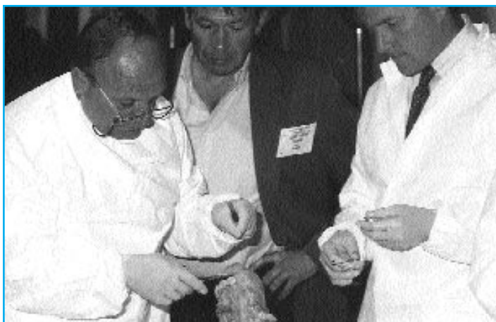
The Mini Hands-On Labs ran daily during the lunch hours.