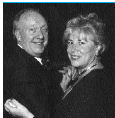
Romance on the dance floor at the Farewell Banquet!