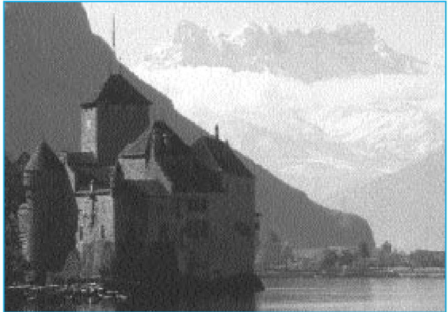
The 2001 ISAKOS Congress will be held in Montreux, Switzerland, located at Lake Geneva overlooking the French Alps.

Montreux, Switzerland, is surrounded by many countries that have local arthroscopy, knee surgery and orthopedic sports medicine organizations. Discussions have already started with these organizations to have their cooperation in planning the 2001 program. Tentatively the local national organizations could host some activity such as a symposium, each forming a specialty day. The plans are to meet with the local national organizations at the next Academy.