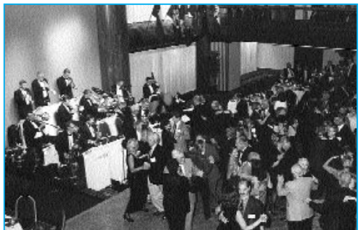
Guests at the Farewell Banquet dance to a 12-piece orchestra.