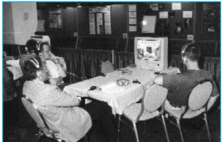
Multimedia stations provided after-hours educational opportunities through free videos and CD-ROMs from the AAOS Library.