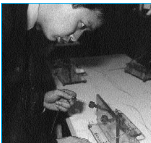
Eight companies sponsored Mini Hands-On Labs.