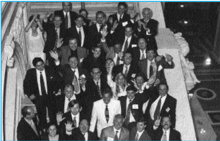
South America was well represented in this group of attendees who gathered for their picture at the Welcome Reception.

ISAKOS Congress at the ISAKOS Web site at www.isakos.com !