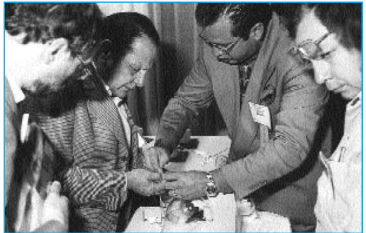
The Mini Hands-On Labs were often filled to capacity.