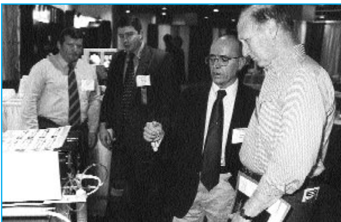
Technical Exhibits ran daily during the ISAKOS Congress.