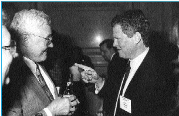
Attendees mingle during the Welcome Reception at the Library of Congress.

(View and download more than 200 photographs from the 1999