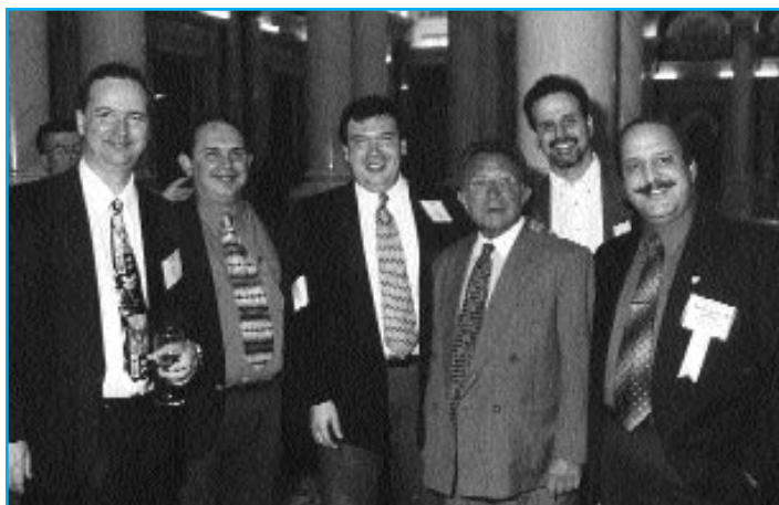
A smiling group of colleagues at the Welcome Reception.