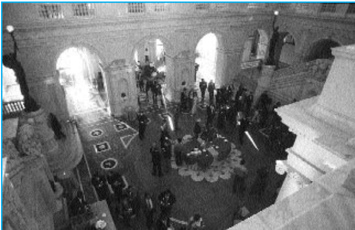
Attendees mingle during the Welcome Reception at the Library of Congress.

ISAKOS Congress at the ISAKOS Web site at www.isakos.com !